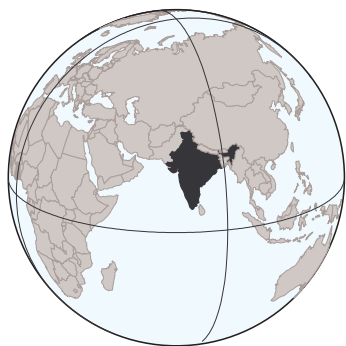
Figure 4: The geographic distribution of corporate activity in Mumbai in 1999.