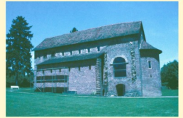
• Einhardsbasilika, Michelstadt-Steinbach, begun in 815