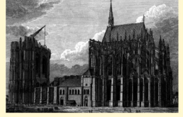
• Dom, Köln, 1248-1560, View shortly before suspension of construction work in the 16th century (Building completed 1842-1880)