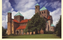
• St. Michael, Hildesheim, begun in 1001