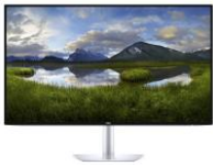
Dell 27 USB-C Ultrathin Monitor - S2719DC