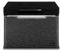
Dell Premier Sleeve - XPS 113 2-in-1