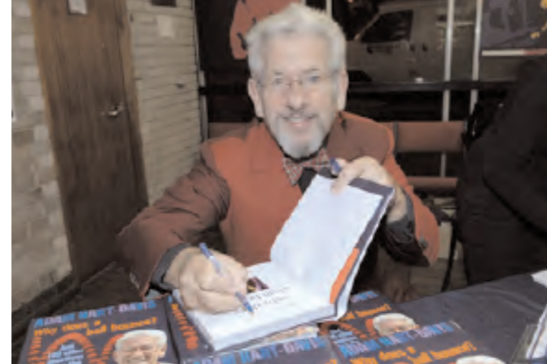
Adam Hart-Davis signs copies of his new book, 'Why does a ball bounce?' following his successful lecture.