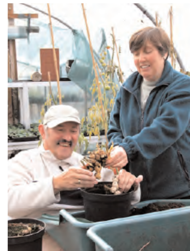
The Thrive project, which examined the benefits of horticulture as a tool for improving the quality of life of older, disabled and other vulnerable people, is just one example of the areas of research the Department of Social Sciences is involved in.