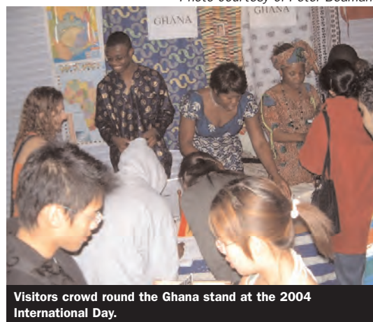
Visitors crowd round the Ghana stand at the 2004 International Day.