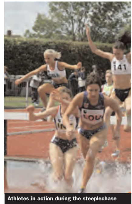
Athletes in action during the steeplechase

Tickets for the Loughborough International Match can be purchased from