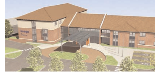
Artists impression of Burleigh Court.