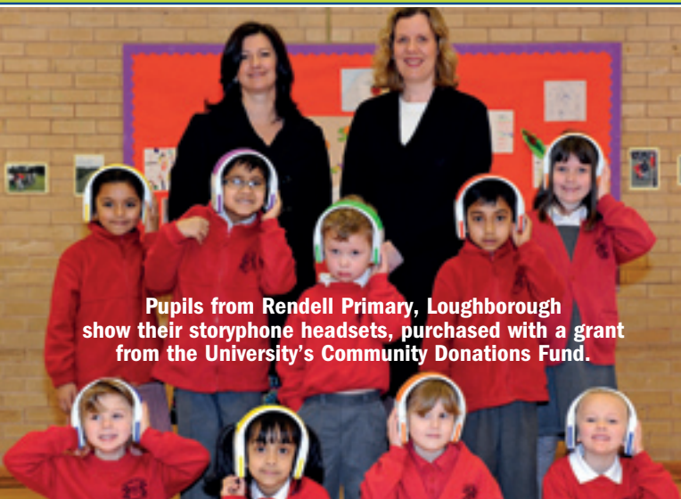
Pupils from Rendell Primary, Loughborough show their storyphone headsets, purchased with a grant from the University's Community Donations Fund.