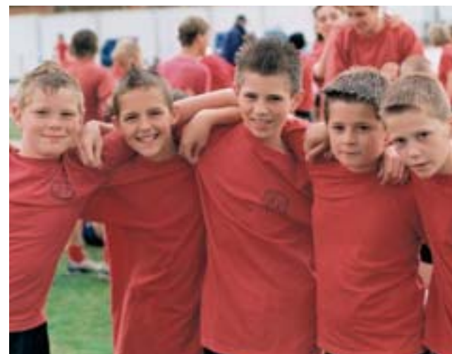
Pupils from Garendon High School at their school sports day.