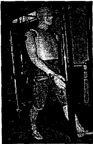
Figure 1. The moving thermal manikin TORE, adapted for measurements according to ENV 342:1998.

The thermal manikin used is one in the TORE-series that has been described earlier (6). The power transmission, in the walking apparatus, has been made with pneumatic cylinders, which gives a simple and durable construction with a minimum of mechanical components.