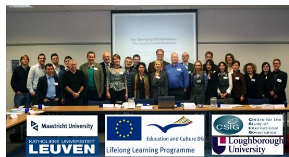
The Conference Participants

This conference – the first event to be held as part of the Jean Monnet Multilateral Research Network on 'The Diplomatic System of the European Union'